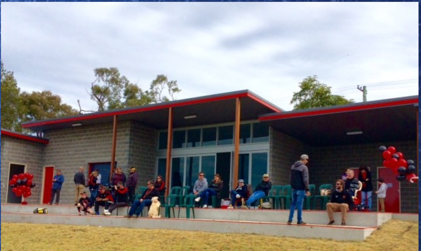
Waratah Park, Sutherland